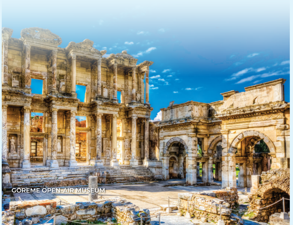
GOREME OPEN-AIR MUSEUM

· *Safranbolu Ottoman House stay offers unique experience. Different room type will be offered and allocate randomly upon check in.