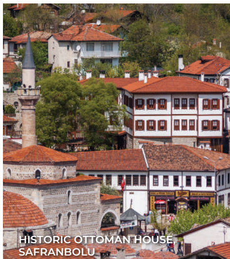
HISTORIC OTTOMAN HOUSE SAFRANBOLU

Breakfast, Lunch, Dinner After breakfast, proceed to visit the 2nd-century Greco-Roman Theatre of Aspendos . Then, make a trip to the Mevlana Museum , a magnificent structure of the famed Persian Sufi mystic in Konya . Thereafter, travel to Cappadocia . Stop en route to admire the amazing masterpiece of the Sultanhani Caravanserai .