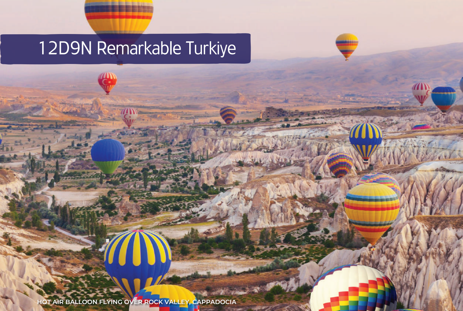
HOT AIR BALLOON FLYING OVER ROCK VALLEY, CAPPADOCIA