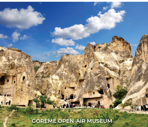
GOREME OPEN-AIR MUSEUM