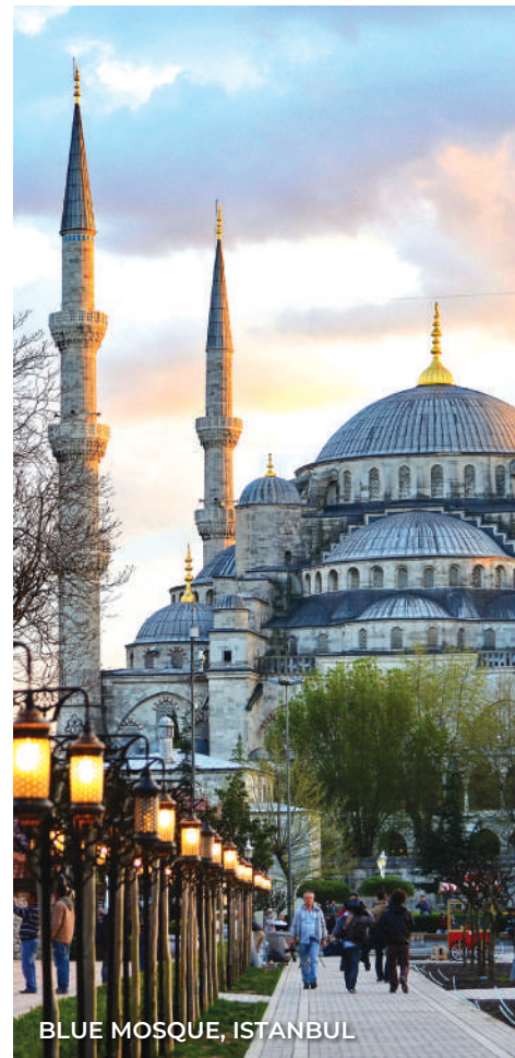
BLUE MOSQUE, ISTANBUL

Breakfast, Lunch, Dinner In the early morning, you may consider going for a famous Turkiye experience - a Hot Air Balloon Ride over the most extraordinary landscapes or a Jeep Safari Tour, at your own expense (subject to weather conditions). Then, kick-start your full day tour of Cappadocia with photos stops to gaze at Pigeon Valley and Uchisar Castle . Next, visit the Goreme Open-Air Museum , a World Heritage Site with fascinating cave churches and biblical frescoes. Enjoy Turkish ice cream between visits to Monks Valley (Pasabag) for memorable photos at one of Cappadocia's picturesque spots. Afterwards, continue to Kaymakli Underground City , once a hiding place for early Christians escaping Arabic persecutors. Last but not least, visit a Jewellery Centre where you can admire some handcrafted natural stones. When night falls, adjourn to a local restaurant for a captivating belly dance show with unlimited snacks and drinks.